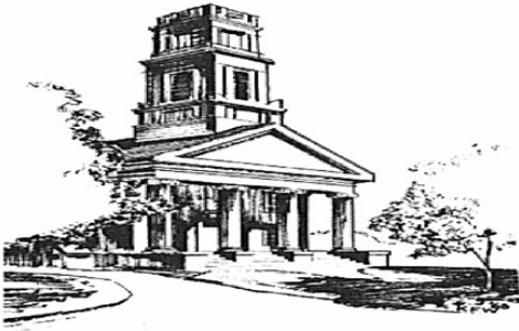
Somers Congregational Church P.O. Box 295 · Somers, CT 06071

Our Church Administrative Assistant edits and publishes the Church Newsletter, Highlights.